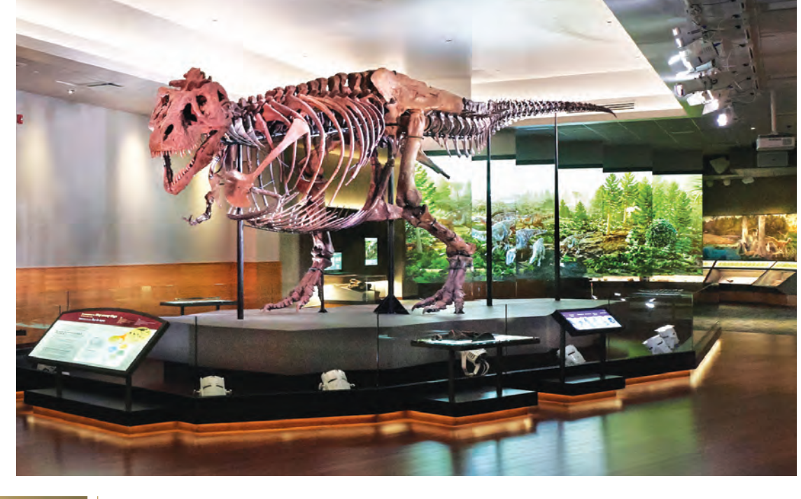
Fig. 1. Completed SUE Hall, Field Museum, Chicago, Illinois, soon after public opening, with sound show and digital animations on glass screens in background.

How to settle down your Tyrannosaurus rex before you take it out in public: vibration-mitigation design for a 67million-year-old museum specimen.