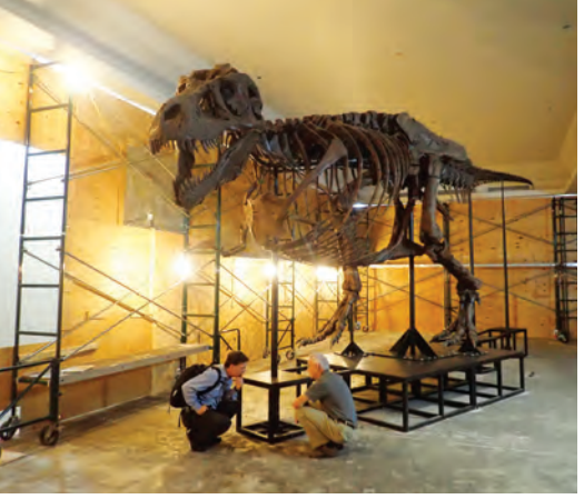
Fig. 2. SUE showing nearly complete reassembly at its new second-floor location when vibration concerns were first identified.

"SUE" is the most complete Tyrannosaurus rex specimen in the world, with approximately 90 percent (by volume) of its actual bones mounted for exhibit. The specimen was discovered in 1990 in western South Dakota from the Hell Creek Formation dated approximately 67 million years old. The Field Museum in Chicago, Illinois, acquired the specimen, catalog no. PR 2081, now one of the most valuable objects in the museum's collection, in 1997 for $8.3 million. From the outset, the museum intended to mount the real bones, not facsimiles, and hired a specialist to produce an intricate steel armature constructed in such a way that the bones could be removed for study. All mounts of real dinosaur bones are fragile, and this one particularly so because of its complexity.