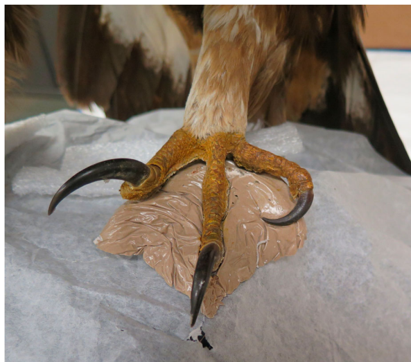
Figure 20. Bulk adhesive fill from Figure 19 after being toned with QoR watercolor paint to integrate visually with surrounding original skin.

microballoons until a thick paste/spackle consistency. The 303HV was not added to the mixture to ensure no dust would stick to it once dry. The final shaping of the spackle was achieved with a heat spatula, once again taking advantage of the thermoplastic properties of 498HV. The fill was toned with QoR watercolor paint (Figure 20).