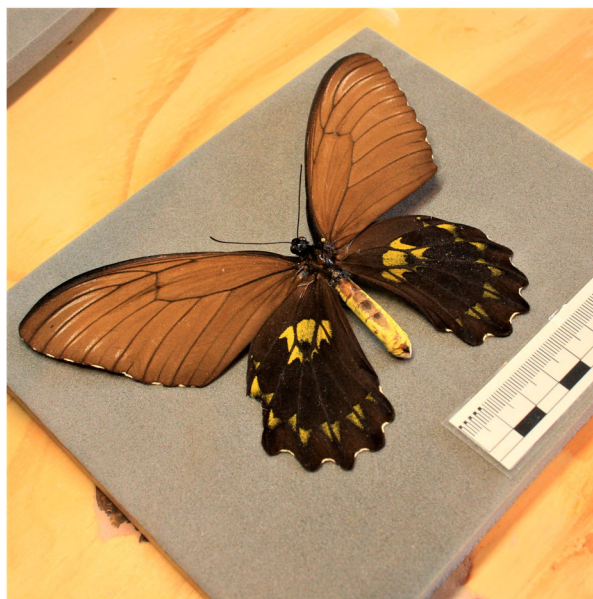
Figure 14. After reattachment of broken Miranda Birdwing butterfly body parts using Lascaux 498 20-X applied directly and as a paste bulked with Japanese tissue fibers.

The Dark Green Fritillary was also repaired using the Lascaux adhesive and Japanese tissue paste. It was applied