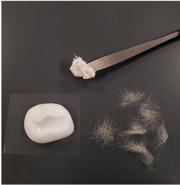
Figure 3. Bulkad adhesive paste (top of the image, on tip of microspatula) formed by mixing Lascaux 498 20-X (bottom left corner) with teased Japanese tissue fibers (bottom right corner).

the desired thickness is achieved. Due to the thermo-plastic property of 498HV and 498 20-V, these fills may be further shaped after drying using a heated spatula.