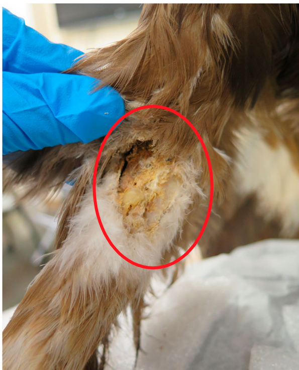
Figure 18. Loss of skin on the front of the proper left leg (tarsus) of a golden eagle taxidermy mount, revealing the interior proteinaceous and manikin materials (circled in red).

smooth surface onto which a fill material could be built and modeled to mimic the texture of the feet (Figure 19). Lascaux 498HV was bulked with glass