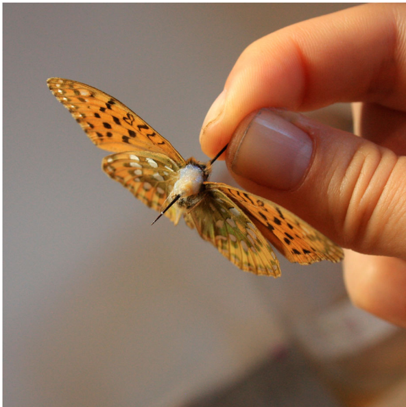
Figure 15. Underside of the Dark Green Fritillary butterfly specimen with a repair to the thorax executed using bulked adhesive paste Lascaux 498 20-X with Japanese tissue fibers.

After years on open display, pest damage incurred on both feet – the eaten skin revealed the cartilage and bone of several digits (Figure 17). Pests may have also created a quarter-size area of loss in the skin on the front of the proper left leg (tarsus), which also revealed the interior proteinaceous and manikin materials (Figure 18). A moderate layer of dust accumulation coated the entire mount, obscuring the natural shine of bird feathers. NPS Objects Conservator Fran Ritchie completed treatment onsite at the park to stabilize and improve the appearance of the specimen.