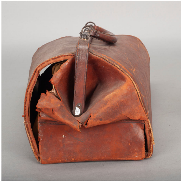
Figure 6. Embrittled and broken leather of end two of Zane Grey's doctor bag.

sections/body of the bag, as well as from the metal frame. The bag could not be displayed in its deteriorated state, and intervention was required to prevent further loss to the torn edges of leather.