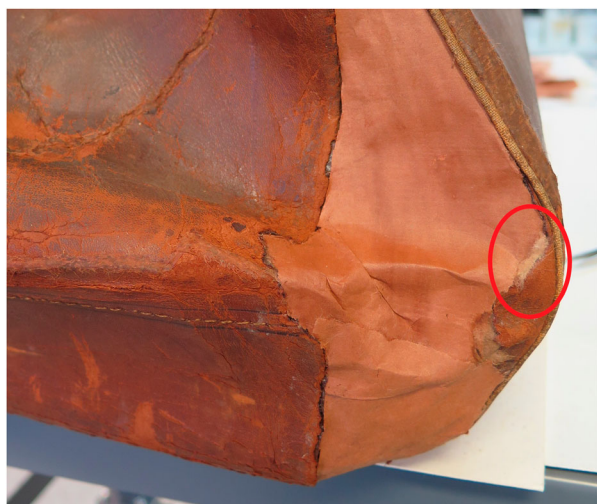
Figure 9. During treatment image of one end of a doctor bag, the same area depicted in Figure 8, but with a toned fill of thick Japanese tissue paper applied directly onto the coated lining using heat applied by a heat spatula. The edges of the paper were then covered with a thin piece of Japanese tissue to feather the line between fill and leather, as shown circled in red. Both the fill and the thin tissue “feathers” were painted further to better integrate with the original leather.

Lifting leather on the metal frame was also secured with the Lascaux, but in these areas, more 303HV was added to the mixture to increase the tack for adhesion to the smooth metal. The mixture was applied with a brush to the metal and to the underside of the leather and clamped until set. Curling leather along the edges of the long sections/body of the bag were first relaxed into position using local humidification (damp blotter paper laid over a semi-permeable membrane). Shrinkage and loss of the leather in these areas also required a fill material. A piece of toned Japanese tissue paper was adhered on top of the edge of leather and extended over the gap of missing leather. Because the fibers on the edge of the tissue have a feathered effect, a lining or fill can be applied to the front (or top, in this case) of a repair and still blend with surrounding surfaces.