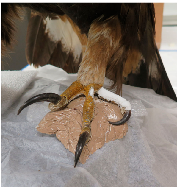
Figure 19. Area of skin loss on a taxidermy golden eagle toe that has been rebuilt using lightweight spackle of Lascaux 498HV bulked with glass microballoons (the white material).

smooth surface onto which a fill material could be built and modeled to mimic the texture of the feet (Figure 19). Lascaux 498HV was bulked with glass