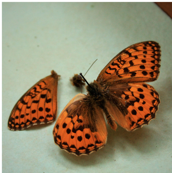
Figure 13. The broken but extant fragments of the Dark Green Fritillary specimen before treatment.

the Lascaux adhesive was mixed with Japanese tissue (Tengu 11gsm) to form a paste, which was applied approximately 5 mm into the abdomen and onto the adjacent area of the thorax. Once slightly tacky, the two sections could be adhered together with finger pressure. The repair was then secured in place with steel pins which were removed once the repair was dry (Figure 14).