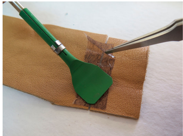
Figure 2. The green Teflon-coated heat spatula tacking down a piece of adhesive-coated lining on a leather surface.

(Mahony 2013). Lascaux 498HV can be used on its own (Anderson and Puglia 2003), or a ratio of 498HV:303HV (Sturge 2011; Mahony 2013). The solvent is applied via brush onto the lining prior to positioning, or once in place, depending on access. Although these characteristics are helpful in certain circumstances, the use of solvents introduces higher human toxicity and requires use of fume hood or respirator, making this method a less safe and more cumbersome option.