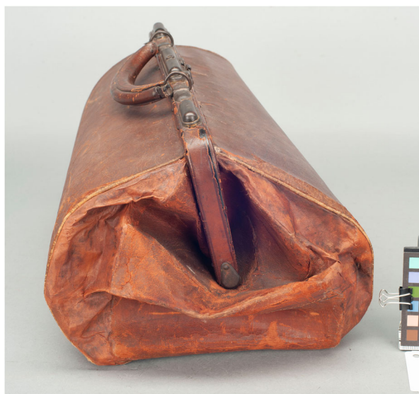
Figure 10. End of the doctor bag depicted in Figures 7–9, after treatment to stabilize leather and fill gaps that could not be repositioned.

The spun-bond polyester and Japanese tissue paper were toned using Golden acrylic paint and QoR watercolor paint (Watercolor pigment mixed with Aquazol binder, sold by Golden Artist Colors, Inc.). Although now structurally stable and visually cohesive with the toned repairs and fills, the bag was not restored to look brand new, but instead retains the look of use (Figures 10 and 11). Scuffs/shallow abrasions in the leather were not toned because upon closer inspection it could not be determined whether the damage was recent. Although the vegetable tanned leather will continue to lose flexibility over time, with minimal handling it may be displayed for many more years.