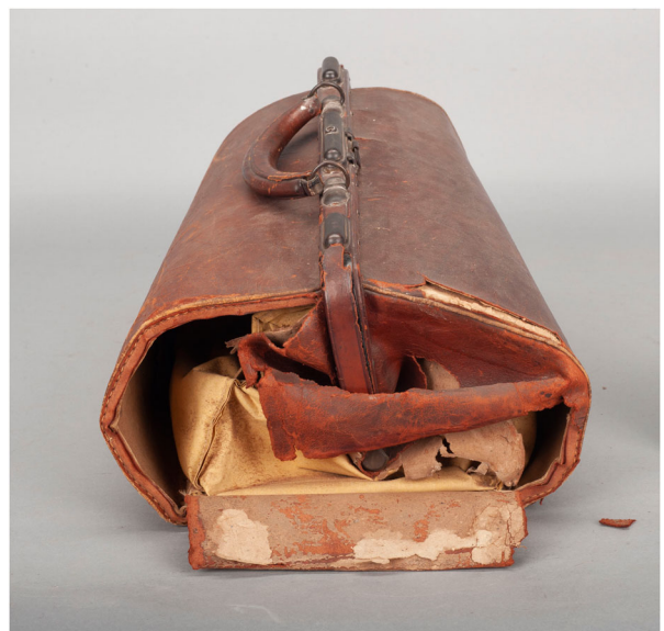
Figure 5. Embrittled and broken leather of end one of Zane Grey's doctor bag from Upper Delaware Scenic and Recreational River NPS site (UPDE 1058).

The embrittled leather of the doctor's bag could no longer flex when the metal frame was opened and closed. Each end tore from the seams, exposing the cloth interior and causing the bag to slump (Figures 5 and 6). The leather curled along the edges of the long