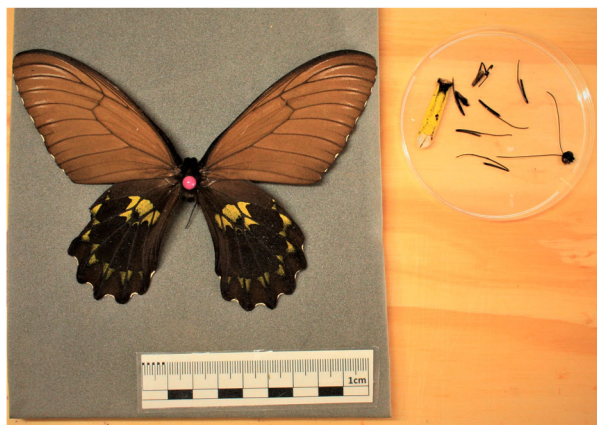
Figure 12. The broken but extant fragments of the Miranda Birdwing specimen before treatment. The specimen is from the entomological teaching collections at the Bournemouth Natural Science Society (BNSS).

Lascaux 498 20-X was selected as the adhesive of choice due to its flexibility and longer working time, allowing the segments to be adjusted slightly if necessary as they dried. The Miranda Birdwing was treated first. The specimen was turned onto its back and placed onto a piece of soft foam. Lascaux adhesive was applied to the legs and head which were gently guided into position on the thorax and secured with steel entomology pins, acting as a brace to hold each segment in place while the adhesive dried. The pins could then be removed. The abdomen of the Miranda Birdwing however was more complicated to attach. Due to the original preparation method, it was completely hollow, with little surface area on which to apply the adhesive. To remedy this,