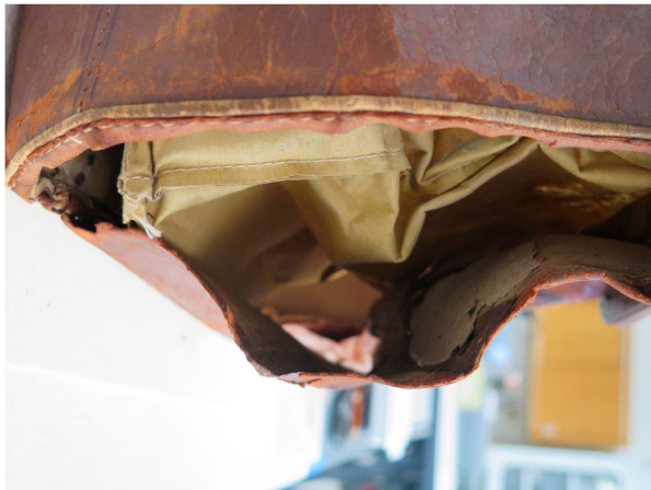
Figure 7. Detail side view of one end of Zane Grey's doctor bag after torn pieces of leather were repaired using linings of toned medium weight spun-bond polyester sheeting coated with a 3:1 mixture of Lascaux 498HV and 303HV, adhered using heat applied with a Teflon-coated heat spatula on the interior surface. Note the gap that remains between the end piece of leather and the body of the bag, exposure the beige inner fabric lining.

After the conservator performed overall surface cleaning with a brush and HEPA vacuum, the tears in the end pieces of the bag were stabilized using a lining of