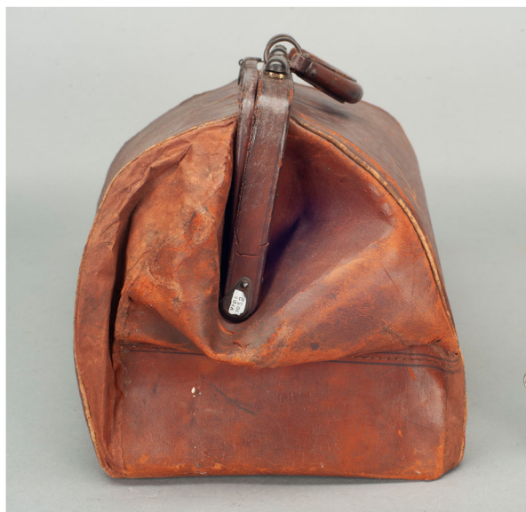
Figure 11. After treatment of end two of the doctor bag. Before treatment, this end is depicted in Figure 6. Steps to stabilize the leather and fill gaps on this end of the bag are the same as those described for the opposite end, depicted in Figures 7–10.

The two specimens from the entomological teaching collections at the Bournemouth Natural Science Society (BNSS) were brought to private conservation practice “Palumbo Conservation Services” for treatment by Natural History Conservator Bethany Palumbo. Miranda Birdwing Butterfly ( Troides miranda ), a species that inhabits Borneo and Sumatra, is yellow and black