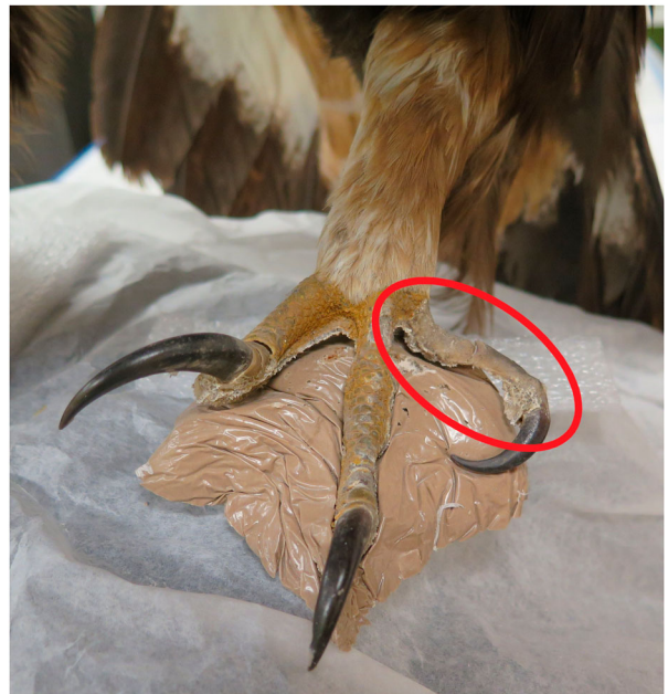
Figure 17. Golden eagle taxidermy mount with pest damage on the toe, resulting in loss of skin and exposure of internal soft tissue (circled in red). The mount is on display at Bryce Canyon National Park (BRCA 1393).

After an overall cleaning using a soft bristle brush and vacuum, the losses in the feet were repaired by first covering the exposed inner materials with a wet application of Japanese tissue paper and 3:1 Lascaux 498HV:303HV mix. The tissue covering provided a barrier layer and