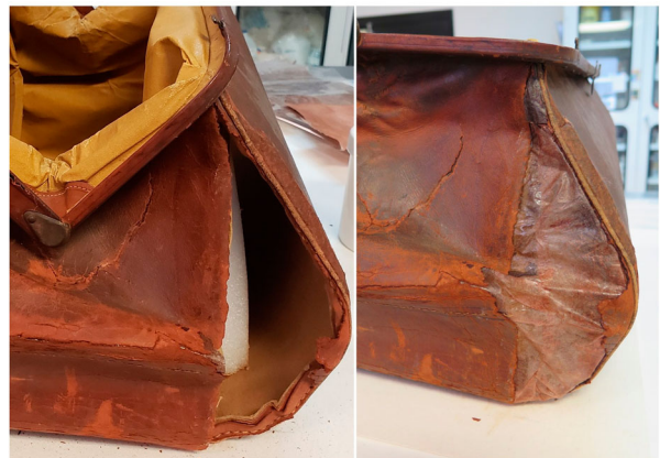
Figure 8. During treatment images of one end of a doctor bag. After tears in the leather were lined and repaired, a large gap remained between sides of the bag, as illustrated in the image on the left. Due to shrinkage of the leather, the gap could not be closed and instead was supported and filled by applying a tinted piece of spun-bond polyester coated with Lascaux 498HV:303HV 3:1 mixture. After painting the adhesive mix to the interior of the leather edges, the fill was adhered around the perimeter of the gap using a heat spatula. Note the shiny appearance of the adhesive-coated toned fill in the image on the right.

After the end pieces were repaired, gaps remained between the body of the bag and the ends, due to shrinkage of the leather. The leather was too brittle to “force” into its original position, so a toned fill was added to bridge the gap, creating a visually integrated support. The same Lascaux mix was applied with a brush to the edges of the leather on each side of the gap, then the tinted and coated spun-bond polyester was heat-set around the perimeter edges. Once in place the adhesive-coated side remained outward-facing, providing a surface onto which toned pieces of thick Japanese tissue paper were directly applied using heat (Figure 8). The tissue was painted to blend further with surrounding leather and thinner pieces of toned Japanese tissue were applied to feather the line between fill and leather (Figure 9). The process was repeated in two other gaps, the largest in size being approximately 15×7.5 cm and shown in Figures 8 and 9. With the repairs and fills in place, the bag is able to be opened and closed, if required.