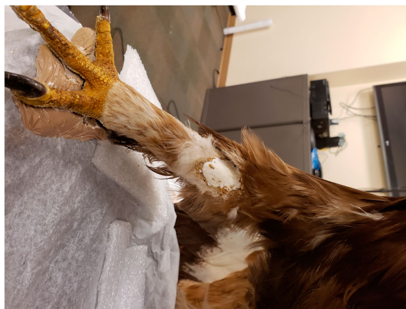
Figure 21. Area of loss on the taxidermy golden eagle leg filled with a lightweight spackle of bulked Lascaux 498HV and glass microballoons.

The skin loss on the leg was also stabilized and restored. A piece of Japanese tissue paper large enough to cover the loss was coated with the Lascaux mix and once dry, inserted under the edges of extant skin. Because the leg skin is thin, a heat spatula could activate the adhesive coating when the heat was applied to the top of the skin – a necessary quality since the back of the lining was inaccessible. The bulked Lascaux