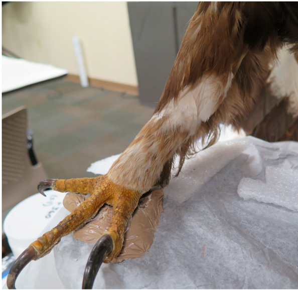
Figure 22. Fill on the taxidermy golden eagle leg from Figure 21 after final blending with trimmed poultry feathers. The feathers were adhered by first dipping the ends of the quills in a tiny amount of Lascaux 498HV and then inserting beneath original feathers.

498HV was spread onto the tissue paper with a micro-spatula to the required thickness to level the repair with surrounding skin (Figure 21). Thin pieces of Japanese tissue with feathered edges were added around the perimeter of the fill to blend the edges, set using heat that activated the Lascaux fill material. After drying the spackle was toned with QoR watercolor paint. To further blend the repair, trimmed poultry feathers were inserted under existing feathers and extended over the fill (Figure 22). The quill ends were first inserted into a small amount of Lascaux 498HV, then immediately tucked into place under extant feathers.