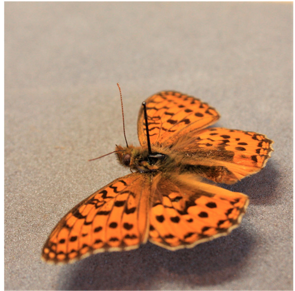
Figure 16. After reattachment of broken Dark Green Fritillary butterfly body parts using Lascaux 498 20-X bulked with Japanese tissue fibers to apply as an adhesive paste.